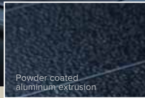
Powder coated aluminum extrusion