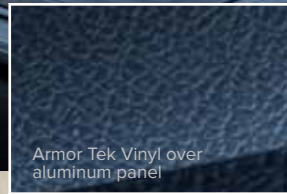
Armor Tek Vinyl over aluminum panel