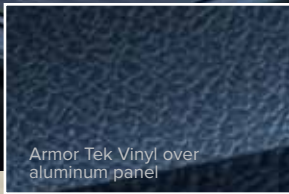
Armor Tek Vinyl over aluminum panel